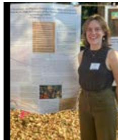
? QII ) T ZWPA XPVWJ a 5 ž* I VL aE